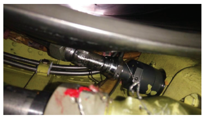
Fig. B – The joint as installed in the SU-30 – This view is within the wing of the aircraft