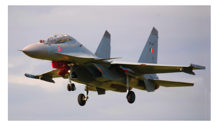
Fig. C – An Indian Airforce SU-30 mid flight.